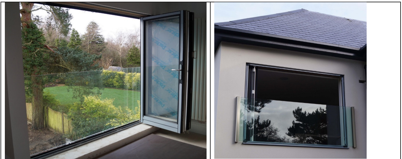
Frameless Juliet Balconies using 21.5mm laminated glass